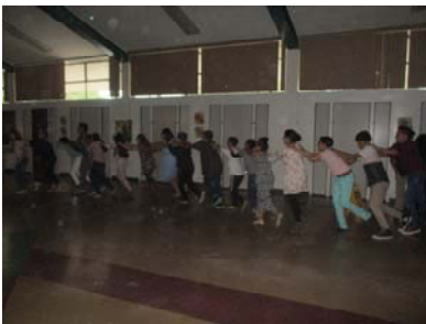
The last Dance!