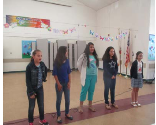
3 of the acts from the talent show

defend or make at least one goal. Roma scores with 6 minutes in the game. It was a goal from Edin Dzeko! Roma is playing and trying hard. They keep on attacking! Goal! Roma scores, 58 minutes in the game from a penalty scored by De Rossi. The score is 2-0, all Roma needs is just one goal so they can pass. The game was about to end at 82 minutes and... Goal! Oh my, Roma had scored! They are passing! They are all happy and they have done it.