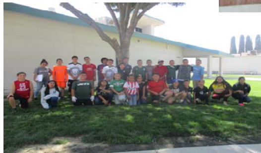
Sports day dress up on August 21