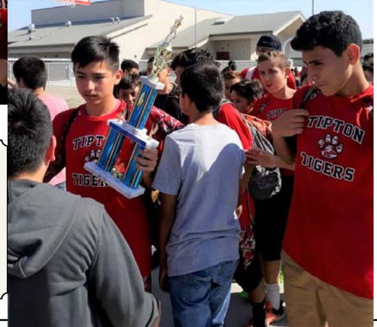
Varsity Football took 1st place in the tournament—great job Tipton Tigers!