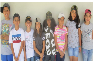
Hat day Sept. 24