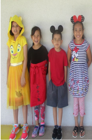
Disney Day Sept. 10