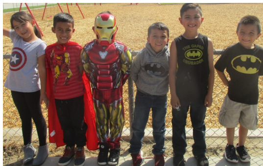
Super Hero Day Oct. 8