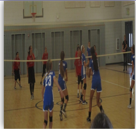
Our Girls playing Volleyball against Sundale