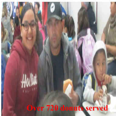
Over 720 donuts served