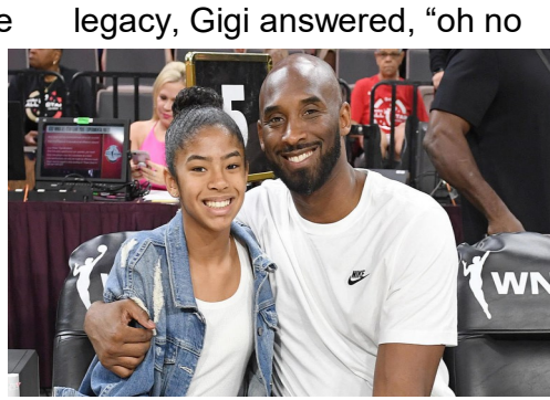
Kobe Bryant and his daughter Gianna Bryant

A legend was born. His name is Kobe Bryant AKA Black Mamba. He and his daughter Gigi died in a helicopter crash on the day of January 26, 2020. It was a tragic day for the world and especially for his family. The whole world was shocked because it was an unexpected and tragic event. One thing we will never forget is his daughter, Mambacita. Gianna Bryant was 13 years old and she wanted to fulfill her father's legacy. When asked if he was going to have a boy to fulfill his