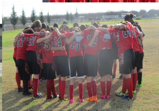
Girls Varsity team before a game in the tournament.