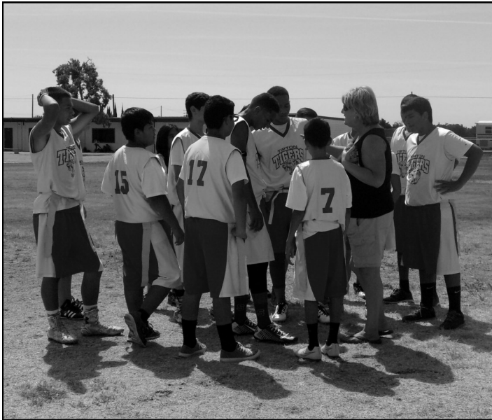
Varsity Football huddling up and planning to try and make the next points