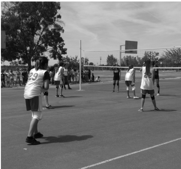
Varsity Volleyball getting ready for the opposing team's serve.