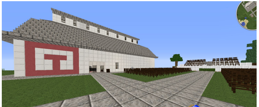
The front of the school as built by the Minecraft elective