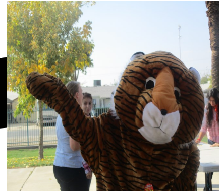
Volume II, Issue 2