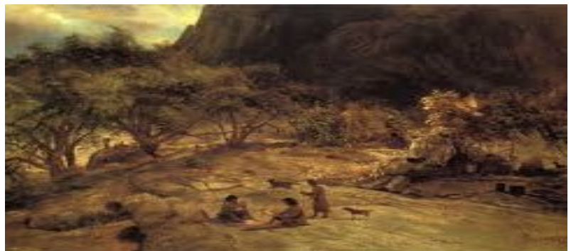
These are the Yokuts that lived in the mountains.

The Yokuts wore skirts made of Tule grass. Where did the Yokuts get the Tule grass? Well they got it from the Tulare river. The Yokuts wore Tule grass because, that was the only long grass there was to make skirts. How did the Yokuts build their houses? The Yokuts lived in different houses. Their house were coned shaped from the top and the bottom is a circular shape. There are so many different kinds of things that the Yokuts did and built to survive.