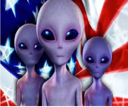
Aliens taking a photo in America!

The first alien sighting was in 1974. Aliens can be harmful or harmless. Aliens have been to earth according to alien sightings . Aliens have more advanced tools than us humans and we have not found an alien's base or home. The only weakness aliens have is being dissected. Some people claim to have seen an alien dive into the ocean . The word alien originally meant belonging to another place or person, but in the 1900's it was used as a word to describe someone from another planet. Aliens might have weapons that we don't know about. People claim that aliens are smarter than us humans because of their spaceships . Aliens visited the Jurassic era, because humans have found weird footprints. Aliens are all kinds of colors and an alien has contacted humans according to the news . Aliens can be all kind of shapes. People think aliens are so smart and that they make robots because there has been pieces of unknown metal found. Aliens can control gravity. The only way an alien can be stopped is by meteorite. We believe in aliens do you?