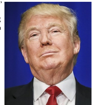
Donald J. Trump