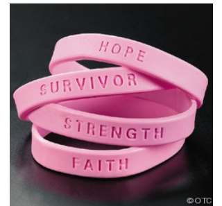
Cancer Awareness Bracelets

only color that symbolizes cancer there are many colors that symbolize many type of cancers. The journalism class had a bracelet fundraiser for cancer awareness month. We went around selling these bracelets to all the classes. During this fundraiser we made money day by day for three weeks. At the end of the three weeks we made $116.30 and sent it to Stanford University.