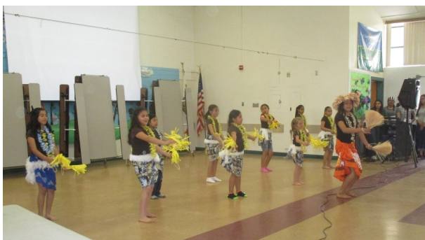
The Hula Group and the Cheer Group