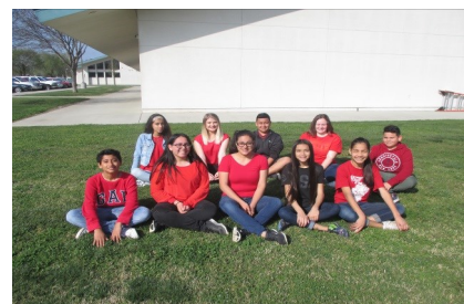
2017 Math super bowl participants !